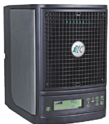
IT-4000 Freestanding Unit

This is the breakthrough you have been looking for